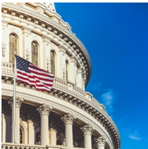
The $2 trillion emergency relief package represents a bipartisan effort intended to assist individuals and businesses during the ongoing coronavirus pandemic and accompanying economic crisis.